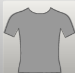
▼ Slim Fit